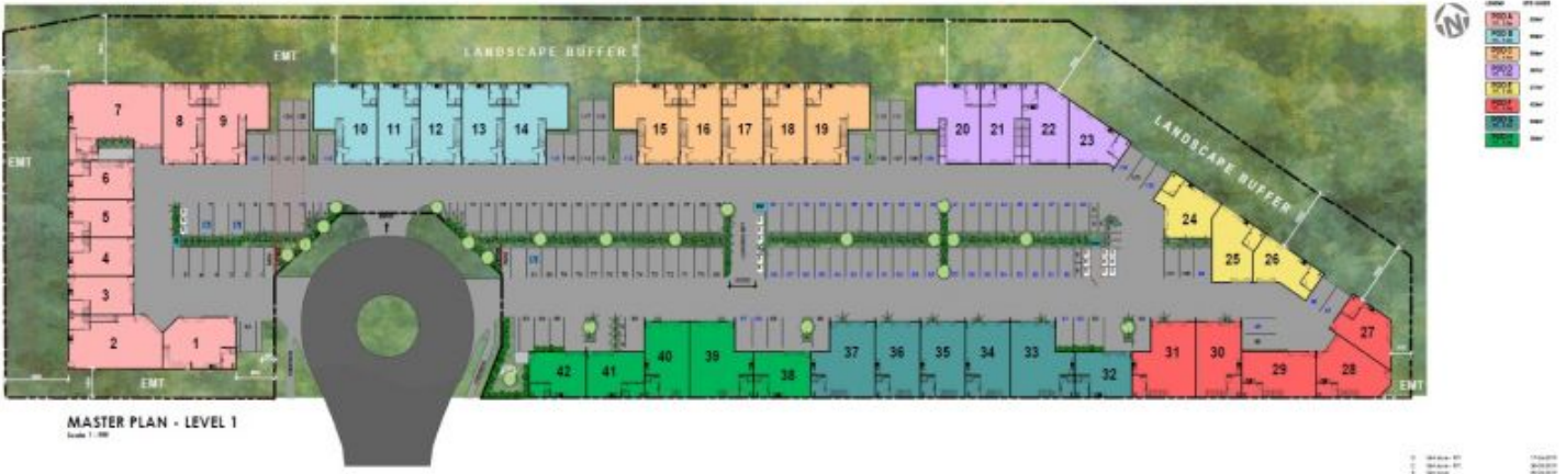
MASTER PLAN - LEVEL 1